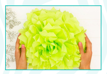
Step 8 Until you have a pom pom!