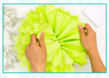
Step 7 Continue to pull away the layers...