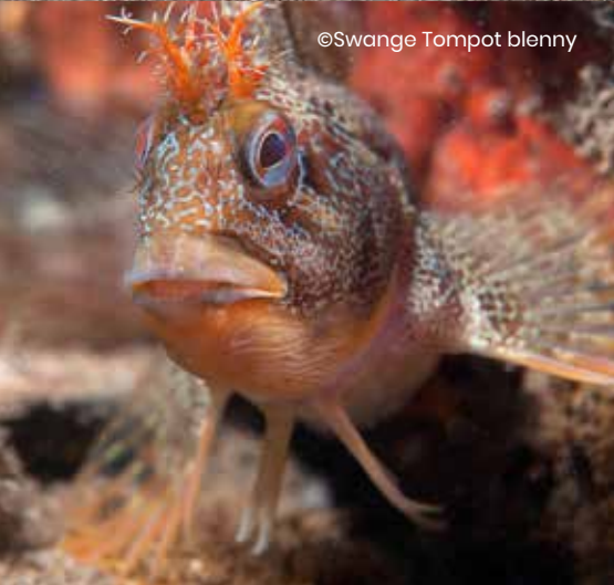
Tompot blenny